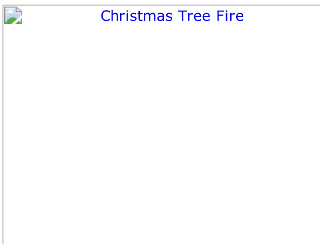
Christmas Tree Fire

For many Americans, scouting the perfect Christmas tree, whether at the local lot or a rural tree farm, is a treasured holiday tradition. Keep in mind that bringing a real tree into the house also brings a real risk of fire, especially if the tree is allowed to dry out in a room filled with flammable furniture, carpets, and gifts. Your glowing centerpiece can quickly turn into a flaming disaster. Check out the video below from the National Fire Protection Association (NFPA) showing the risk of a tree fire and also the difference between a regularly watered tree and one that is left to dry out.